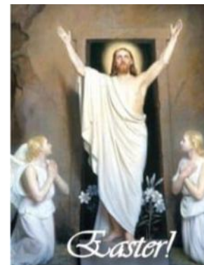
April 12 - 8am Resurrection of the Lord

The summit of the Liturgical Year is the Triduum – from the evening of Holy Thursday to the evening of Easter Sunday. Though chronologically three days, they are liturgically one day unfolding for us the unity of Christ's Paschal Mystery. Note: There is no Easter Vigil this year.