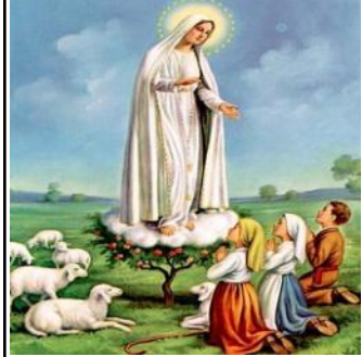
The Blessed Virgin Mary appeared to 3 shepherd children in Fatima, Portugal on the 13th day of six consecutive months, beginning in May 1917.

Subsequent First Saturdays Devotion Will Be Held On . . . July 4, August 1, September 5, and October 3