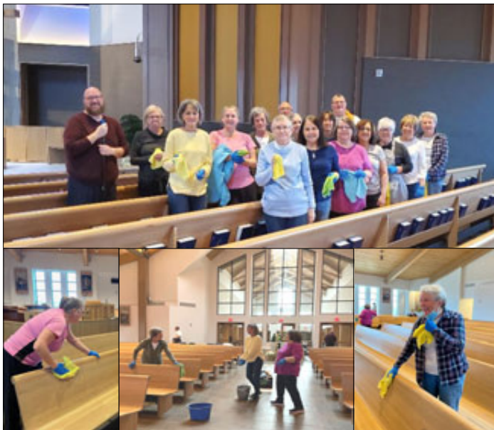
After the 8:15am Mass on March 22 women of the Altar Society, as well as some husbands, spent a few hours cleaning all the pews in the church.