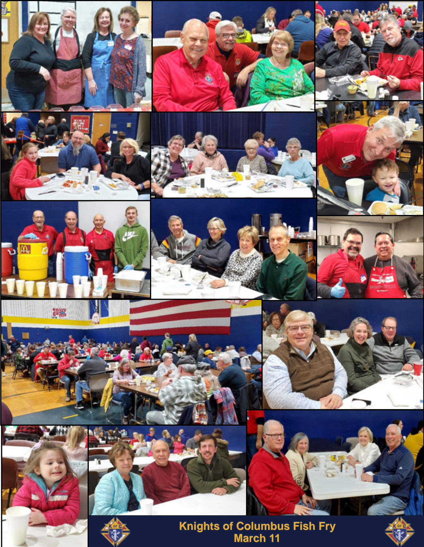
Knights of Columbus Fish Fry March 11