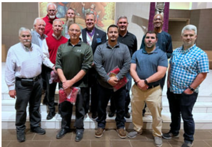
New St James Council 6780 Brothers