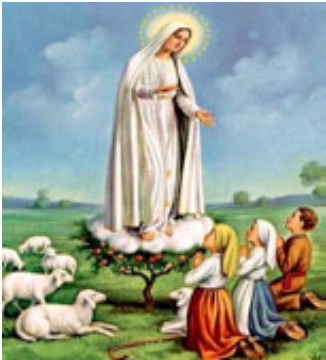
The Blessed Virgin Mary appeared to 3 shepherd children in Fatima, Portugal on the 13th day of six consecutive months, beginning in May 1917.

Join Us on Saturday, May 7 for the 1st of The Five First Saturdays Devotion