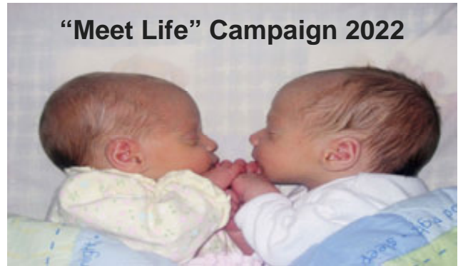
“Meet Life” Campaign 2022

We, the community of St. James, are a prayerful and Eucharistic people who treasure our Catholic traditions. We strive to grow in our faith by being good stewards of the gifts God has given us; sharing God's truth with all. As the Body of Christ, we are called to love and serve everyone, especially the marginalized, with joy and hospitality.