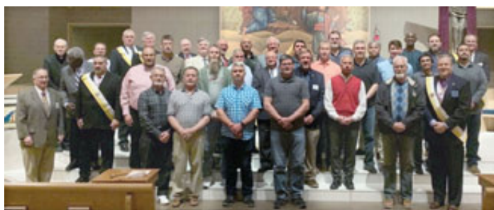
All New Brothers and State Officers in Attendance