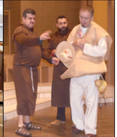
Our Lady of Guadalupe Celebration December 12