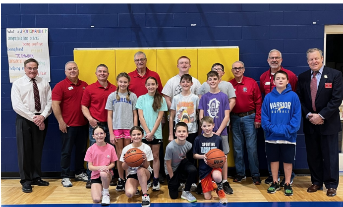
Participants and Judges in the Knights Free Throw Contest - February 5