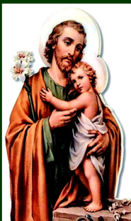
Celebrating the Feast of St. Joseph

March 18 11am - 7pm • Social Hall Traditional St. Joseph's Table Meal Spaghetti Plain or with Milanese Sauce and More Carryout Available Cookies, Cannoli, and More Available for Sale March 19 • Parish Hall Cookies, Cannoli, and More Available for Sale