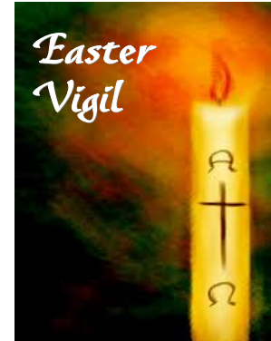
April 8 - 7pm Service of Light Liturgy of the Word

The summit of the Liturgical Year is the Triduum – from the evening of Holy Thursday to the evening of Easter Sunday. Though chronologically three days, they are liturgically one day unfolding for us the unity of Christ's Paschal Mystery.