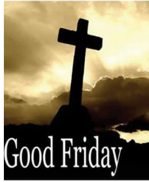
April 7 - 7pm Passion of the Lord