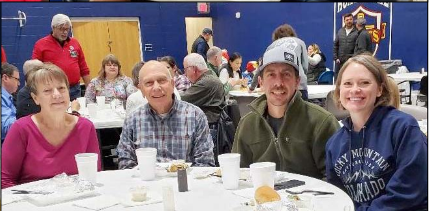
Seen at the first 2024 Knights of Columbus Fish Fry on February 16th