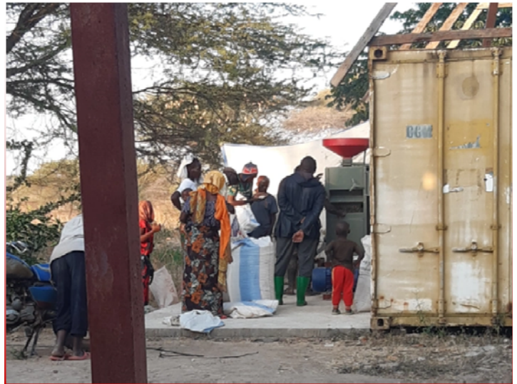
Rice Hulling Machine in action – the money generated by hulling the rice helps pay for maintaining the hospital and dispensary.