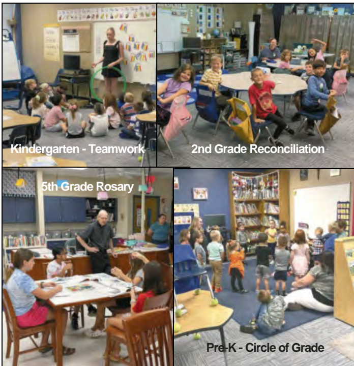
Kindergarten - Teamwork