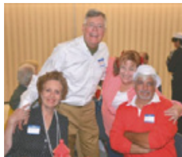
Enjoying the evening at one of the past "kick-off" dinners.

We have diverse members, travelers, sports fans, readers, runners, music lovers, golfers and gardeners just to name a few interests and they are also connected with a number of other parish ministries. All are friendly and enjoy welcoming and getting to know new parish members. Each couple hosts one "dinner" preparing the main course, other couples bring appetizers, salad and dessert. It doesn't have to be fancy and you don't have to break out the