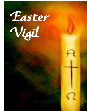
April 4 - 7:30pm Service of Light Liturgy of the Word

The summit of the Liturgical Year is the Triduum – from the evening of Holy Thursday to the evening of Easter Sunday. Though chronologically three days, they are liturgically one day unfolding for us the unity of Christ's Paschal Mystery.