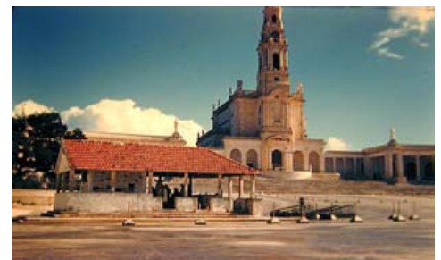
The Basilica at Fatima, Portugal. The tiled building, left foreground, is the original Shrine marking the exact spot where Our Lady appeared to the children.

Our Lady of Fatima continues to work miracles today through Fatima water which is sent from Fatima around the world. This water sprang up in Fatima at the spot the Bishop told people to dig, very near where Our Lady appeared at the Cova de Iria (the Cove of Peace). The water is known to cure people with sicknesses and poor health. Other people are cured when they go on pilgrimage to Fatima, about 90 miles north of Lisbon, Portugal.