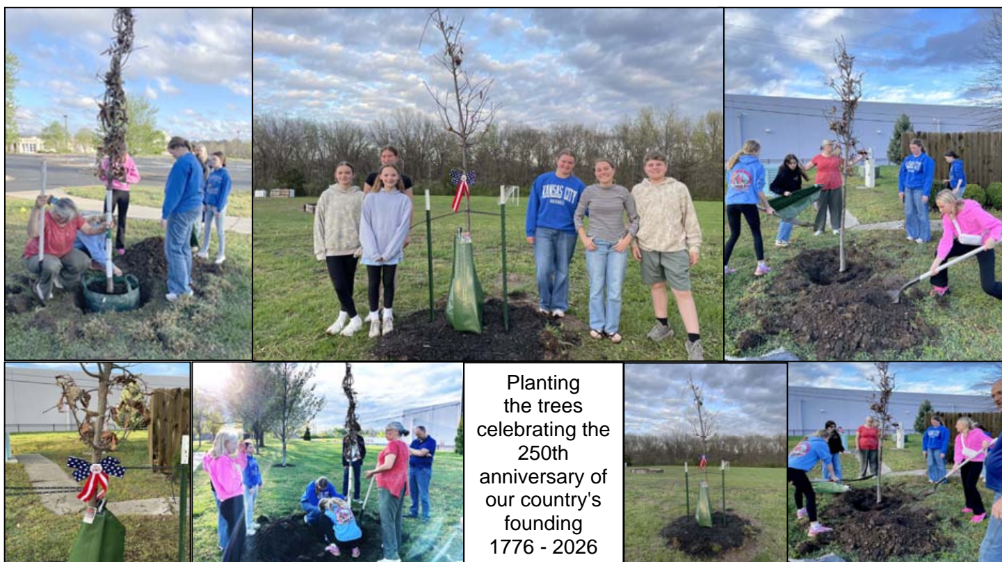
Planting the trees celebrating the 250th anniversary of our country's founding 1776 - 2026