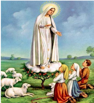
The Blessed Virgin Mary appeared to 3 shepherd children in Fatima, Portugal on the 13th day of six consecutive months, beginning in May 1917.

Join Us on Saturday, May 2 for the 1st of The Five First Saturdays Devotion